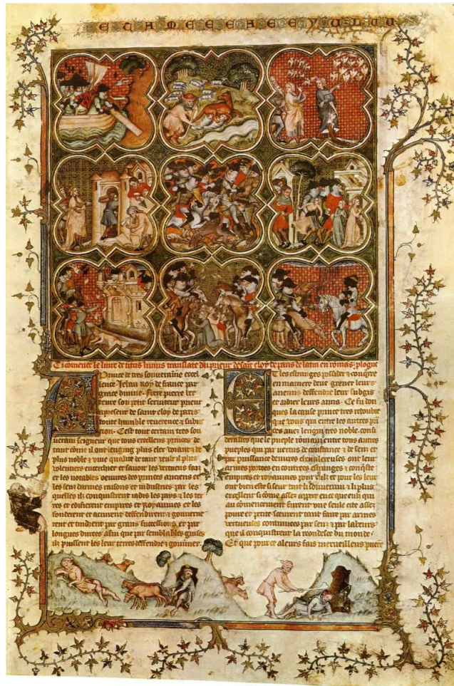
Livy, Paris, Saint-Genevi: https://commons.wikimedia.org/wiki/File:Livy, Paris, Sainte-Genevi%C3%A8ve, Ms. 777.jpg?uselang=de

internationally. In those places where they were able to take root and be passed on to new generations of scholars, these practices continue to raise the bar today. Similarly, standards achieved in Germany for examining medieval and early modern manuscripts are seen around the world as exemplary thanks to decades of support from the DFG [German Research Association]. In this way, significant corpuses of sources have been systematically made accessible for further exploration – a deposit that clearly requires new generations of trained scholars to mine it.