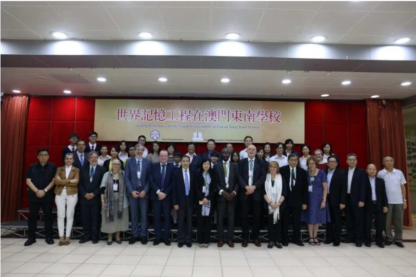
MoW delegates and students and officials of Tong Nam School

The students then asked the visitors to give their reflections on the work of the Tong Nam School with the Memory of the World Programme and its registers. We expressed our appreciation of the enthusiasm and commitment that had been amply demonstrated in the artwork and audiovisual presentations we had seen in Tong Nam School.