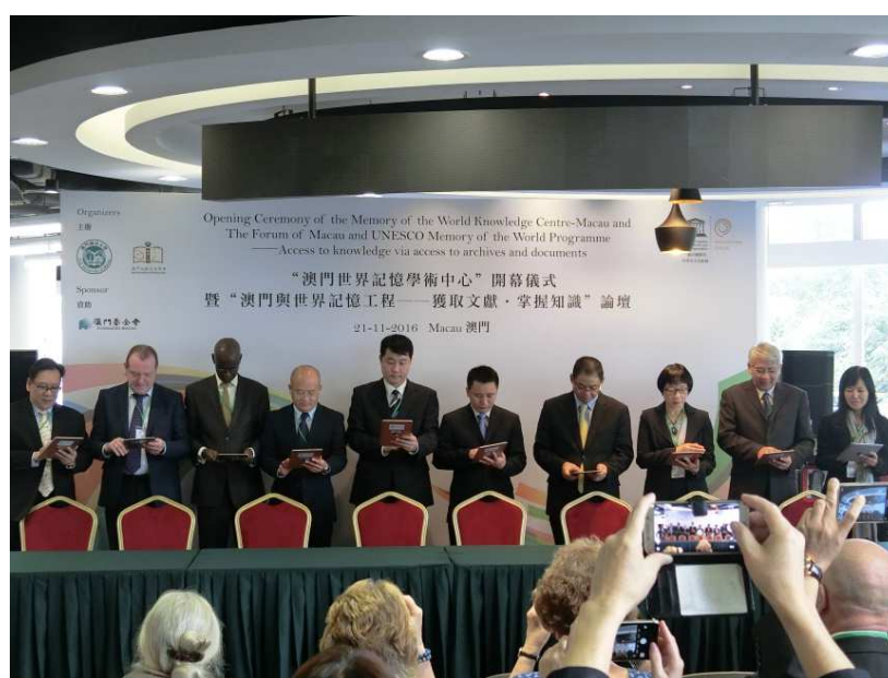
The lighting ceremony to open the Macau MoW Knowledge Centre