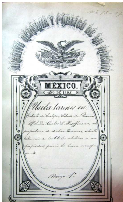
General Archive of the Nation. Archive of Land Searches and Transfers, Volume 27, Dossier 13.