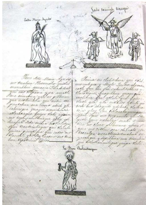
General Archive of the Nation. Land Fond, Volume 2998, Dossier 3, Page 17v.