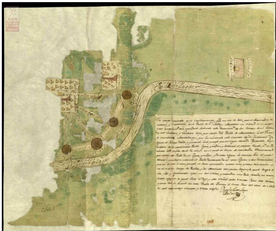
General Archive of the Nation. Map, Diagram and Illustration Fond, Item No. 2461. From the Land Fond, Volume 3556, Dossier 2, Page 26B.