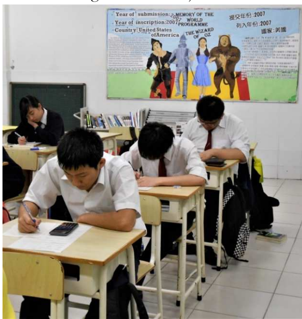
Colourful and creative posters illustrating Memory of the World inscriptions decorate classrooms in Tong Nam School

Our first encounter was with a series of storyboards in the School's entrance foyer describing the activities of the United Nations, UNESCO, and the Memory of the World Programme. This was just the beginning: as we moved through the School we were confronted with posters about Memory of the World and documentary heritage located in stairwells; and other posters on classroom walls dealing with and illustrating specific Memory of the World register inscriptions. These colourful and creative posters provide a daily backdrop to students working on other subjects.