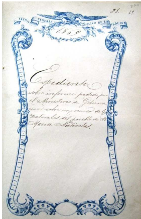
General Archive of the Nation. Archive of Land Searches and Transfers, Volume 1, Dossier 28. 254 pages.