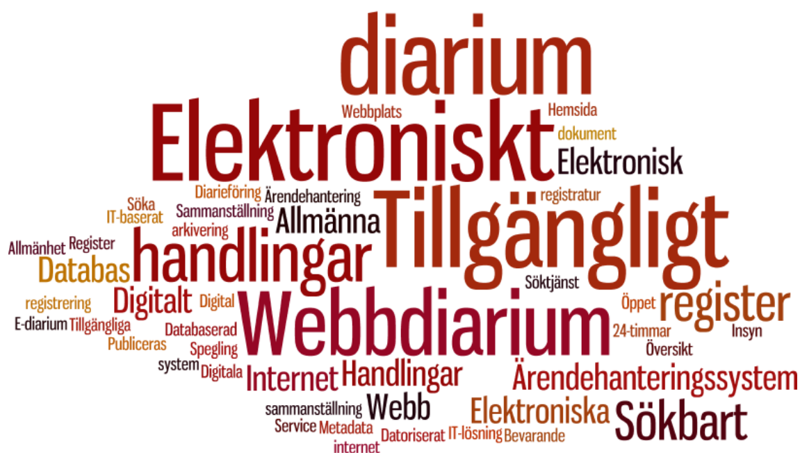
Figure 4: In the answers to Question 9 “available”, “electronic” and “online register” are three of the words mentioned in several of the explanations of the term e-register.

Three respondents provided no explanation and one responded ‘Don’t know’. Because this question is important for the thesis, all comments are provided in Appendix 2, and a selection is presented below: