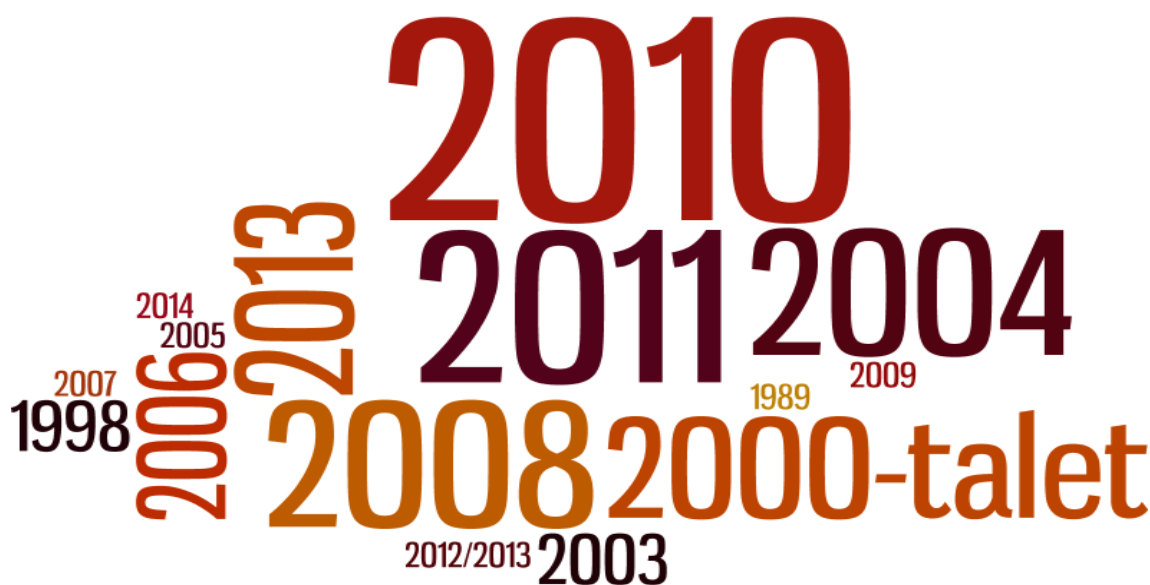
Figure 5 There was a wide variety of answers to Question 13, about what year the e-register was introduced.

Respondents could answer Question 12 about who initiated the introduction of the e-register, by selecting multiple options. Approximately a third (35 percent) of respondents answered “Management” and about 20 percent “Other”. In these cases it was often joint projects where several professions were involved.