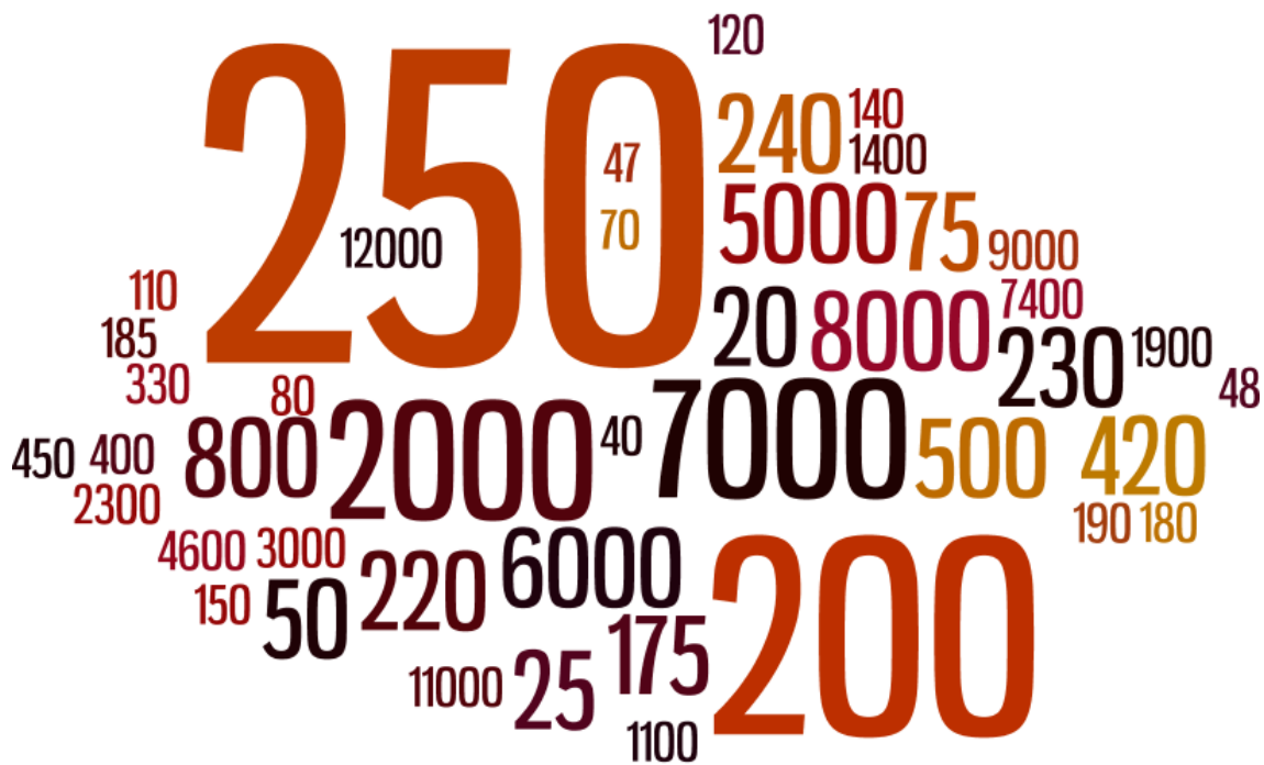
Figure 3: Question 2 is about the size of the organizations that the respondents belong to, and the responses vary greatly. Some chose to answer the number of employees in their unit, while others state the total number of employees.

Question 2 asked the respondents to state the number of employees employed by their organization. The purpose of this question was mainly to get an idea of the size of the organization. In connection to the answers to the next question, who is in charge of registration, it would have been interesting to ask more detailed questions about organization and work distribution. This could have indicated how many are involved in the registration of public documents on a daily basis. However, because of the scope of this thesis, it was excluded.